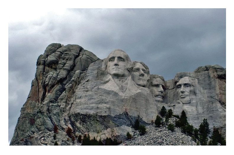
Figure 11. Mount Rushmore sculptures. Photograph by Kelly Martin is distributed under a CC BY-SA 3.0 license (Wikimedia Commons-h, 2017).

Underground for structures serve extraordinary objectives. Mount Rushmore sculptures (Figure 11), one of the amazing structures of the rock engineering, were completed in 1941 after being carved for 14 years. 18 m high sculptures of George Washington, Thomas Jefferson, Theodore Roosevelt and Abraham Lincoln were carved from granite made in the Black Hills of South Dakota (Romana et al., 2007; America's Library, 2016.). This structure may be one of the best example in which art meets rock mechanics. Before carving the sculptures, a detailed investigation was performed at site and weathered rock was removed by blasting (Goodman, 1989).