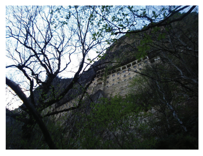
Figure 10. Sumela Monastery. Şekil 10. Sümela Manastırı.

Şekil 9. Nemrut Dağındaki heykeller.