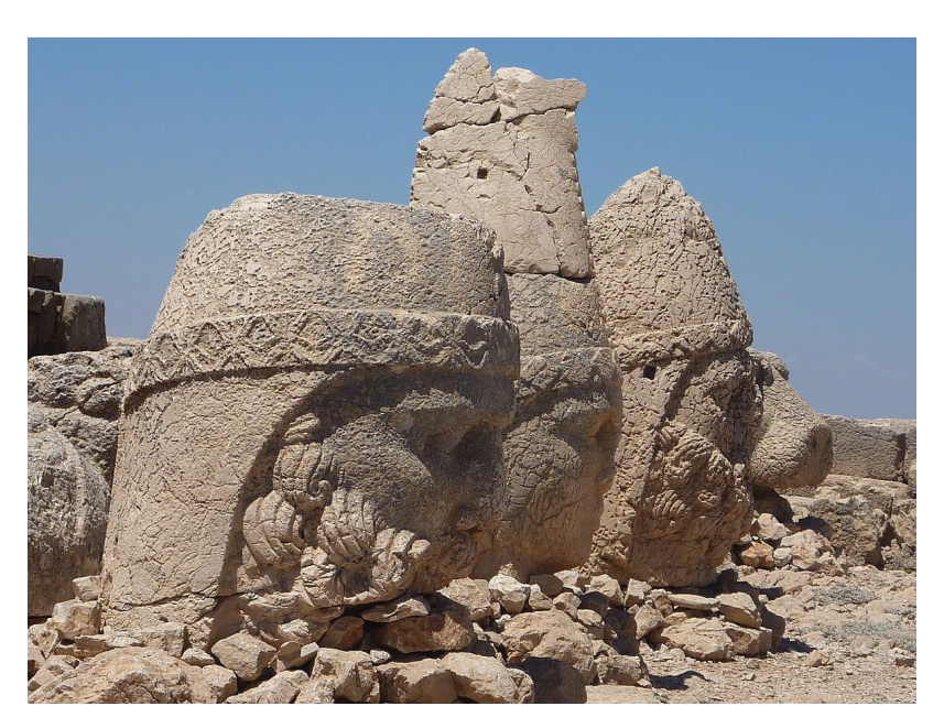
Figure 9. Head statues at Nemrut Mountain.

Şekil 9. Nemrut Dağındaki heykeller.