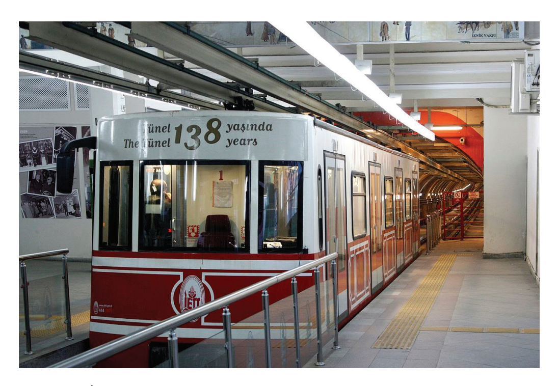
Figure 5. The Tunnel in İstanbul. (Photograph by Florian Lehmuth is distributed under a CC BY-SA 2.0 license (Wikimedia Commons-c, 2017).

Şekil 5. İstanbul'da Karaköy - Beyoğlu arasındaki Tünel. Fotoğraf Florian Lehmuth tarafından çekilmiş olup CC-BY-SA-2.0 ile lisanslanmıştır. (Wikimedia Commons-c, 2017).