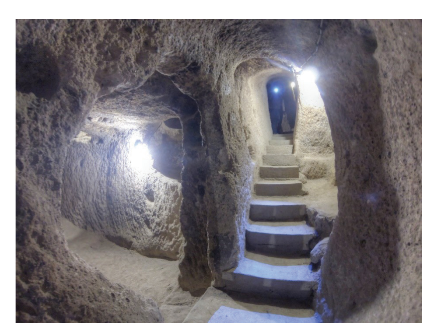
Figure 8. Kaymaklı underground city in Cappadocia.

Şekil 8. Kapadokya'daki Kaymaklı yer altı şehrinden bir görünüm.