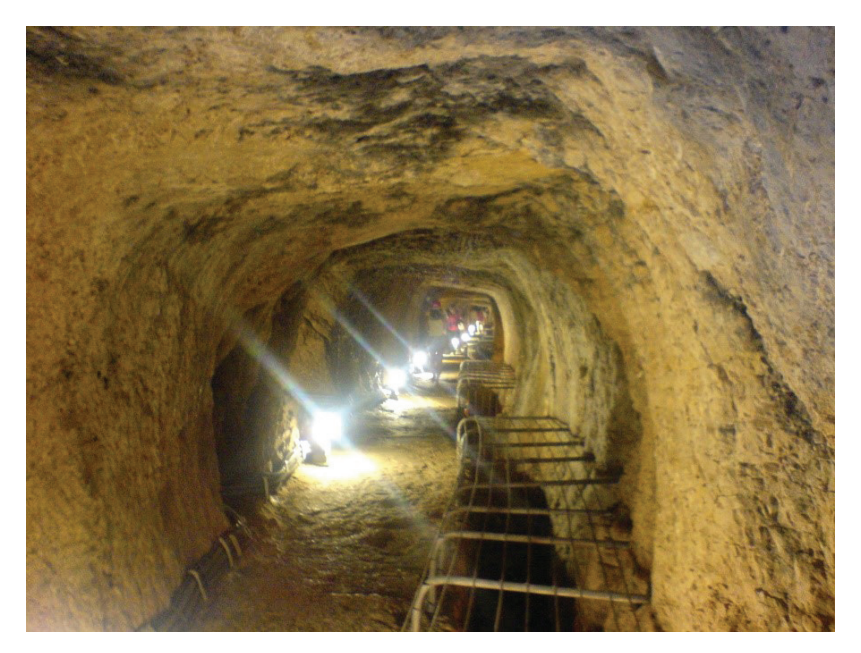
Figure 2. A general view of Eupalinos tunnel constructed in Samos Island (Wikimedia Commons-a, 2017). Şekil 2. Sisam adasında açılan Eupalinos tünelinden genel bir görünüm (Wikimedia Commons-a, 2017).

About 2700 years ago, ganats, which were special water management systems in Iran were constructed. The aim of the construction of the ganats was to supply water to settlements and arid areas for irrigation purposes. This water supply system consists of shafts and a tunnel that connects these shafts. Water, from water table via shafts and transferred to the tunnel, is transmitted through the tunnel by gravity. Gonabad Ghasbeh Qanat is the oldest ganat with 45 km length (Alemohommad and Gharari, 2010; Garry, 2012). Tunnels were also constructed for water supply purposes. Greek engineer Eupalinos of Megara constructed the Eupalinos tunnel (Figure 2) that was excavated from both sides, in Samos Island in 520 BC (Garry, 2012).