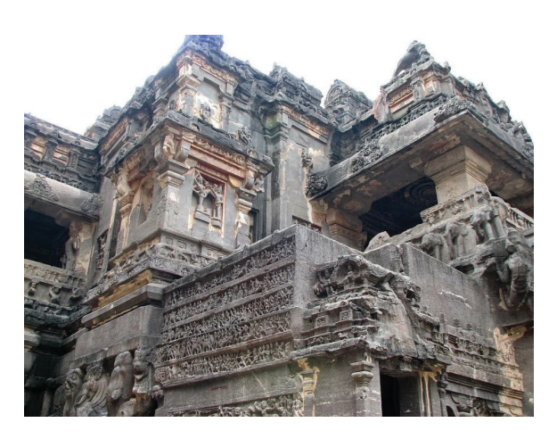
Figure 7. A view of the monuments located in Ellora that is accepted as a world heritage.

Şekil 7. Dünya mirası olarak kabul edilen Ellora kasabasında yer alan anıtsal kaya yapısından bir görüntü.