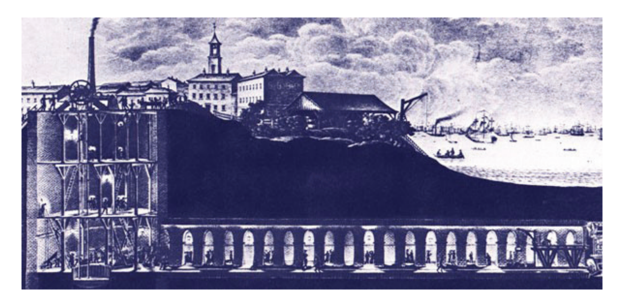
Figure 4. The Thames Tunnel. Lithograph by Taulman after Bonisch is distributed under public domain (Wikimedia Commons-b, 2017)

The use of rock structures as a part of public transportation can be mentioned as another significant progress. In 1863, the Baker Street Station, the oldest underground station, was built as a part of subway system. The Tunnel in Istanbul is known as the 2<sup>nd</sup> subway system and is followed by big cities such as Paris, Berlin, Chicago, Stockholm, Moscow, Budapest etc. (Szechy, 1973; Garry, 2012). A photograph of the Tunnel is presented in Figure 5.