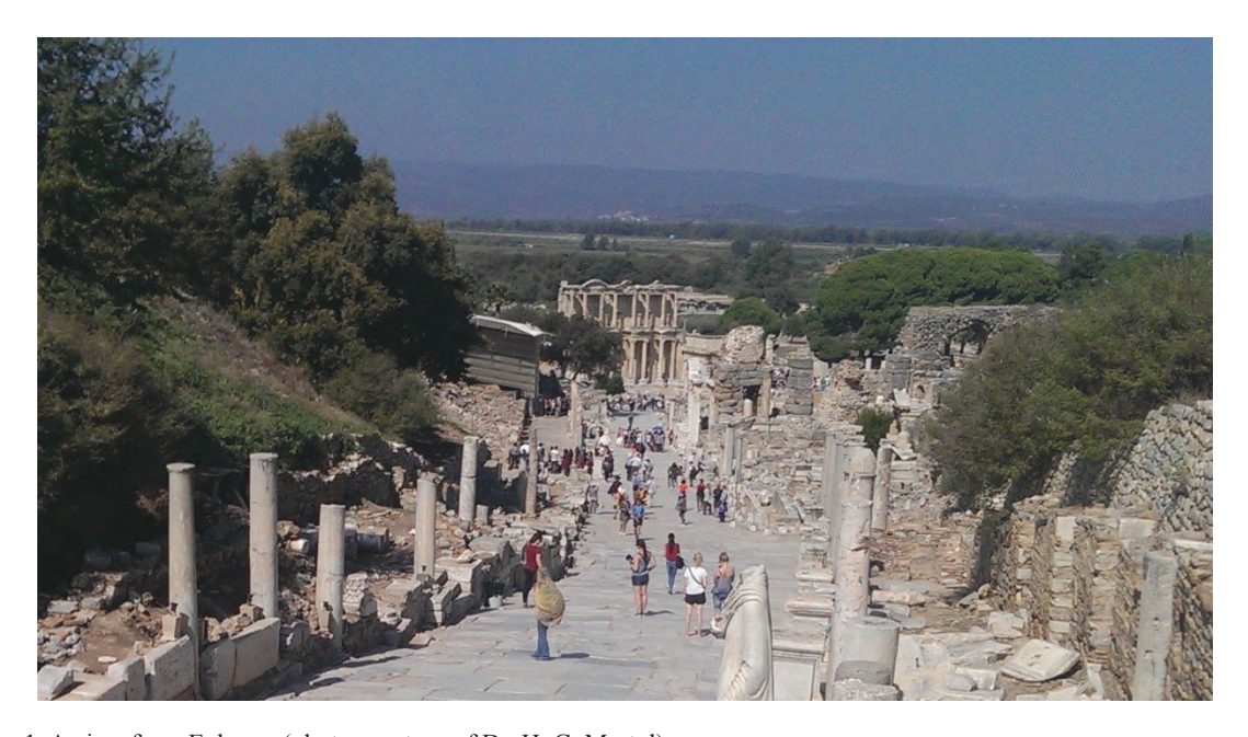
Figure 1. A view from Ephesus. Şekil 1. Efes Antik Kenti'nden görünüm.

1), Stonehenge and Pyramids were built of rock. The underground structures were constructed and used for sanctuaries, tombs or for storage of goods. Besides, depending on the mankind needs, rock tunnels were driven to transfer water to the towns or to protect the towns from floods as well as to communicate with other societies. In this review paper, some breathtaking examples of rock structures of ancient and modern times will be given and a brief explanation about the development of rock mechanics will be presented.